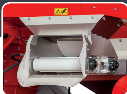
Adjustable speed lateral conveyor belt

Equipped with a fan for each of the 2 trays and 2 lateral conveyor belts, this simple machine lets you process the cleaning from high volume harvests at enhanced speeds.